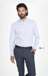
BEVERLY MEN 01650